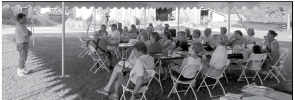
Summer member event at Broadturn Farm in Scarborough showcasing a successful land trust and farmer relationship

goal is ethical practice and sustainable conservation. 3RLT is well equipped to accomplish its goals!