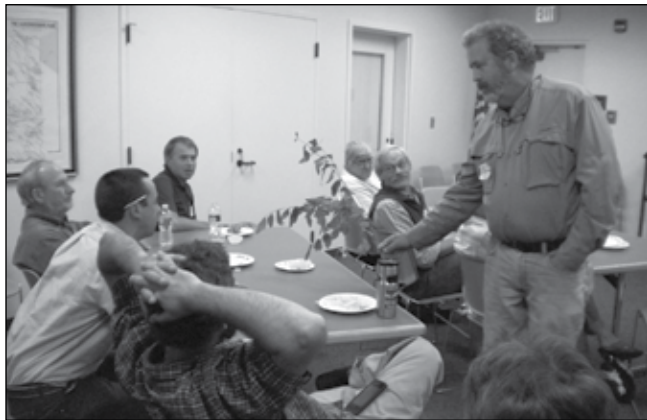
Fall member training on invasive plant species identification and management.

Across the country, land trusts are reaching out to partners to be more effective. We see different geographic areas collaborating for regional conservation projects and joint fundraising, or land trusts forging relationships with non-conservation organizations to reach new audiences and build allegiances.