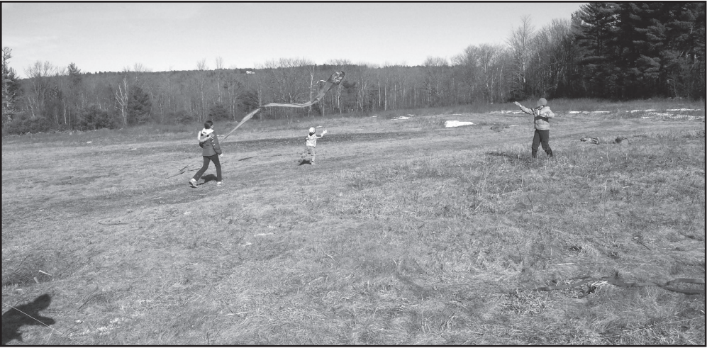
Who says kites are for summer? Children play at Hobbs Farm for Great Maine Outdoor Weekend in February

Participants marked up maps, voiced concerns and broke into groups for discussions on common topics. The collective feedback ranged from the visionary to the practical. Many people emphasized the land trust’s traditional role in conserving undeveloped land so it is always available for rural uses, recreation, water quality protection, and wildlife. Others suggested new roles for the trust – such as developing an education program, a regional trail network and model forests;